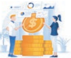
Payment & Collection