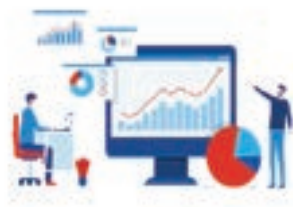
Dashboard & Reports