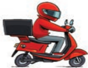
Scheduled Tour Plan